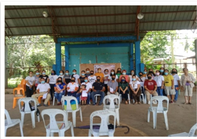
Group Photo of Attendees and OLT Community Extension Services Facilitating Faculty