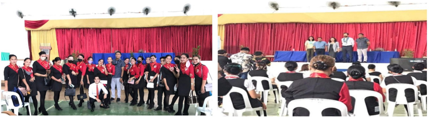
Photo with the school director, school president, chairman of the board and Director of CASA College