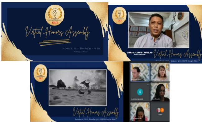
Facebook.com/olt.ozamiz (dissected from the live video of the Virtual Honors Assembly and World Teacher's Day program)

Although the event happened in a virtual setting, the message it imparted was visually seen which showcased how appreciation is so important for college students. Last October 4, 2021 aired through Facebook live and google meet, OLT's first honor assembly took place.