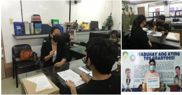
Office of the school registrar

TES is a grant-in-aid program of the Commission on Higher Education (CHED) under Republic Act (RA) 10931, or the Universal Access to Quality Tertiary Education Law (UniFAST), signed by President Rodrigo R. Duterte in 2017. This has helped millions of students across the Philippines for almost five years since then.